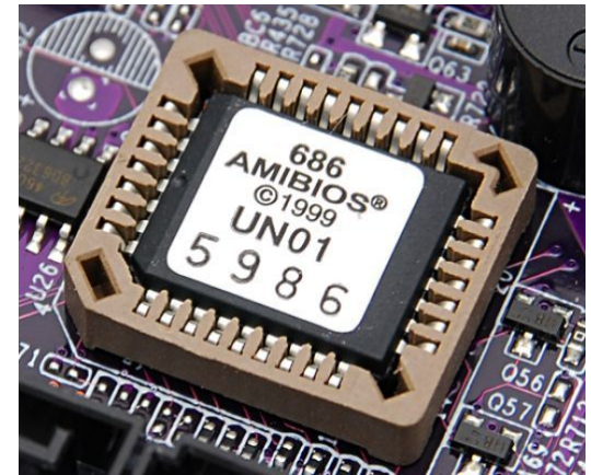
AMIBIOS chip on a motherboard

Traditionally the BIOS (Basic Input/Output System) is the first program (actually a firmware) that is executed after booting the PC. It usually resides in a chip that can be soldered or removable. The role of the BIOS is to perform hardware check and initialization for starting the operating system.